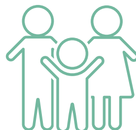
A thriving Cardinia