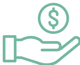
Matched Giving Opportunity